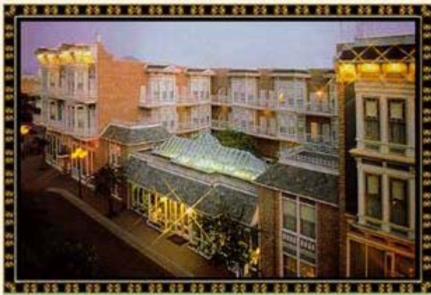
The Horton Grand Hotel A Distinctive Victorian Experience

Featuring a networking reception and two days of industry education found nowhere else